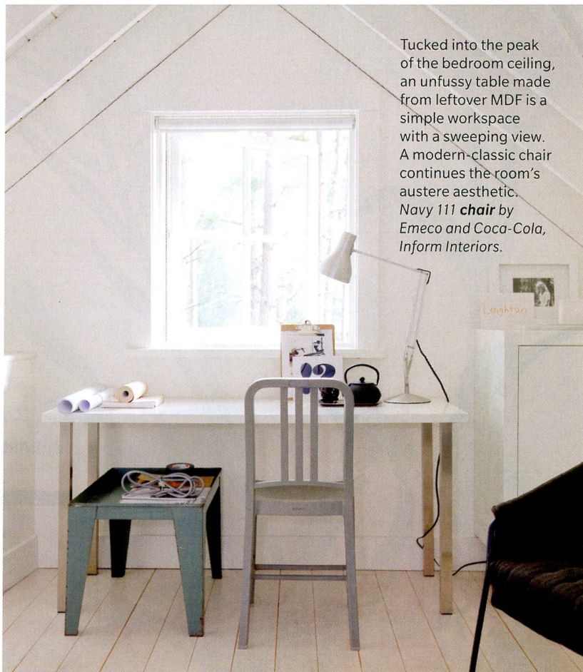
Tucked into the peak of the bedroom ceiling, an unfussy table made from leftover MDF is a simple workspace with a sweeping view. A modern-classic chair continues the room's austere aesthetic. Navy 111 chair by Emeco and Coca-Cola, Inform Interiors.

Serene and elegant, the cabin's one bathroom employs the same palette and materials. Towels, Country Furniture. A low bed is edgy in its minimalism and gives the sleeping loft a youthful energy. The wardrobe rack keeps clothing housed at the cottage to a minimum — all part of the family's desire to live simply while here. An Ivano Redaelli chair has sink-in comfort. Bedding, Country Furniture; Ivano Redaelli chair, LivingSpace. A large, nubby sisal rug grounds the all-white great room and injects natural texture over the silky poured-concrete floor. Floor lamp, Lightform; trellis-print throw pillow, McCarthy Hinder Interior Design. Carrie's collection of modern pottery — a mix of pieces from local artisans and thrift stores — finds a home on the kitchen's open shelving, reiterating the handmade ethos. Sleek lower cabinets are simple and practical. Dishwasher, Trail Appliances; speckled white bowl, white vase (top right), Janaki Larsen.