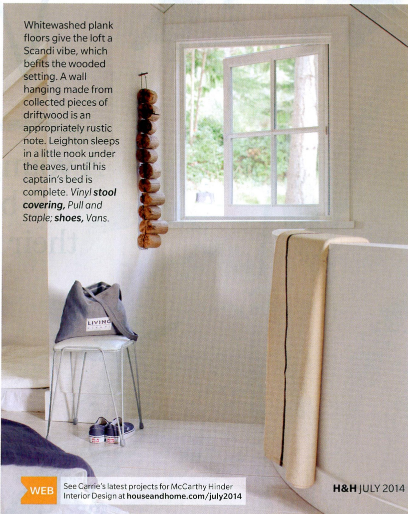
Whitewashed plank floors give the loft a Scandi vibe, which befits the wooded setting. A wall hanging made from collected pieces of driftwood is an appropriately rustic note. Leighton sleeps in a little nook under the eaves, until his captain's bed is complete. Vinyl stool covering, Pull and Staple; shoes, Vans.